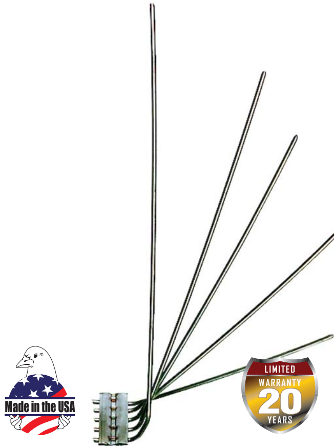
Image shows the 5 wires per inch half row wire coverage. (Shown 20% larger than actual size)